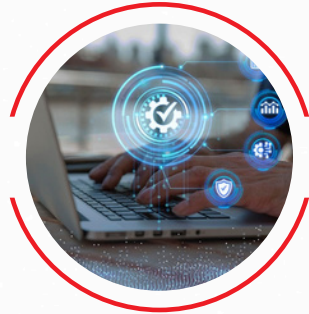
Technology & IT