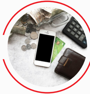
Finance & Banking