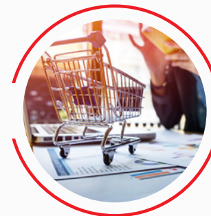
FMCG & Retail