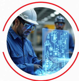
Engineering & Manufacturing