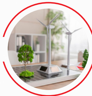
Energy & Sustainability