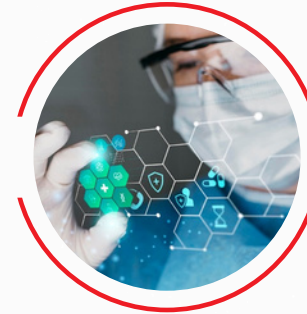
Healthcare & Life Sciences